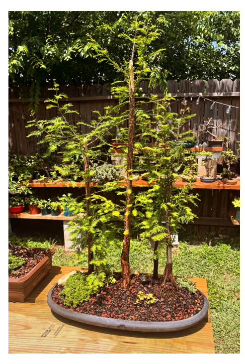
AJ'S BALD CYPRESS FOREST