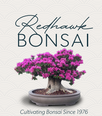
Nursery Floral Class 2 Lic #0822998

Please note that the information and repotting schedules are suggested guidelines for the Coastal Bend and South Texas area.