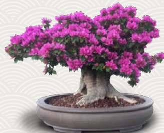
Cultivating Bonsai Since 1976