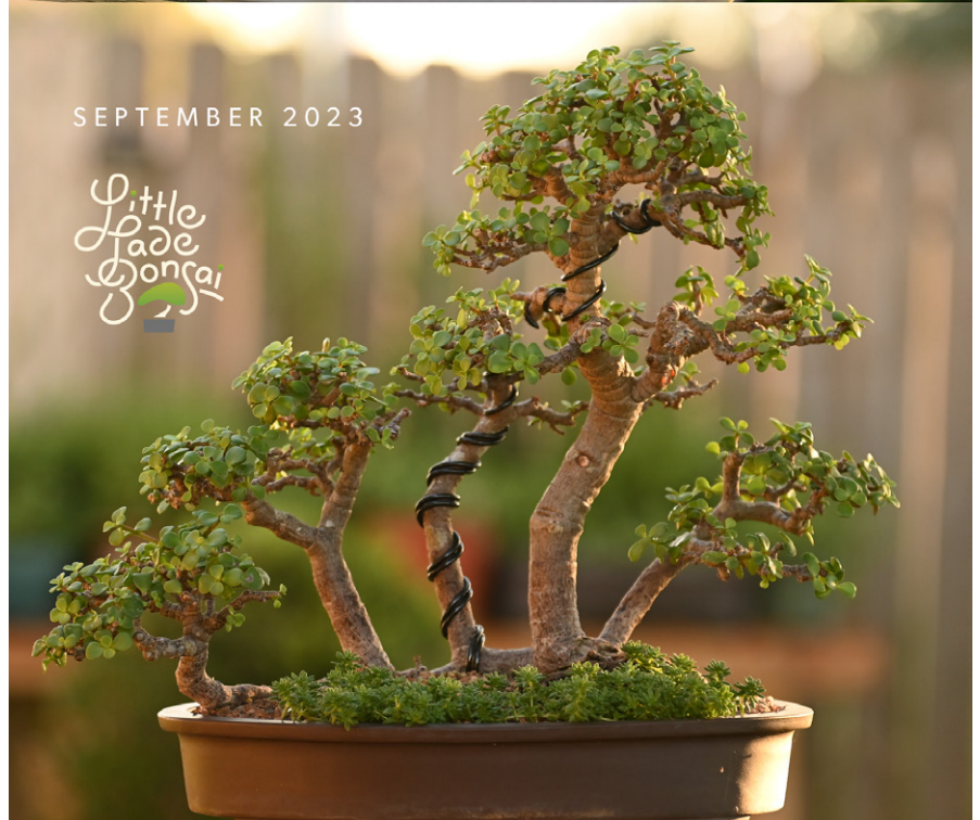
Raft style dwarf jade forest