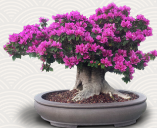
Cultivating Bonsai Since 1976